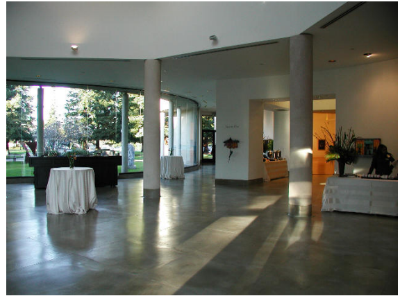
At the main entrance of the museum, the Rotunda has a stone floor and a long curling wall of glass allowing a direct view of the redwood grove and sculpture garden.