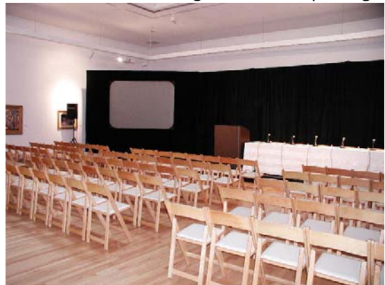
The Cowell Room is 1911 square foot, has light wood floors.