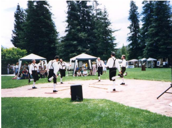
The Sculpture Garden is a seven-acre lighted park with redwood groves, manicured lawns, pathways and patio. Great for festivals, corporate events and receptions.