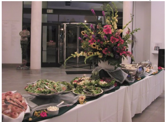
The Rotunda is a perfect place to host the food and beverage portion of your event.