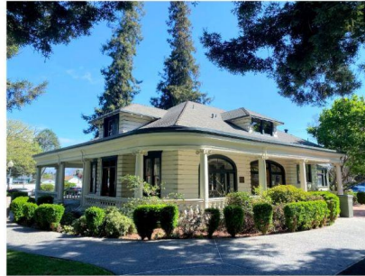
The Historic Jamison Brown House

$525.00 per hour with a minimum of 5 hours (cleaning deposit $400.00)