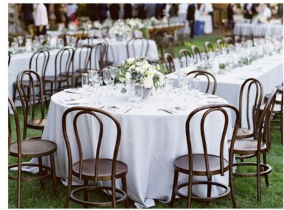
The Lawn, Redwoods, & Sculpture Garden Area

$275.00 per hour with a minimum of 4 hours (cleaning deposit $300.00, max capacity 150)